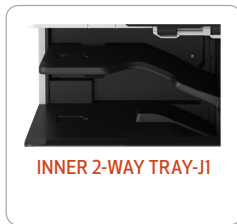
INNER 2-WAY TRAY-J1