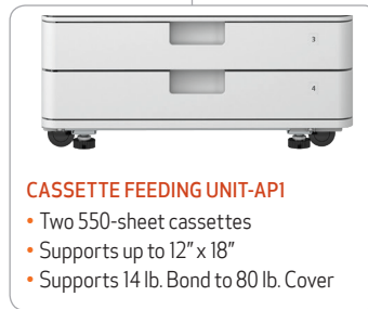
CASSETTE FEEDING UNIT-API