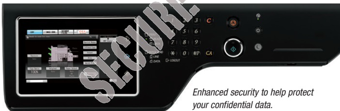
Enhanced security to help protect your confidential data.

The MX-M364N/464N/564N Essentials Series offers several layers of standard security to protect your business and user information . Standard features include data encryption, data overwrite protection, confidential printing and more. And, with Sharp's convenient End-of-Lease feature , all job data and user data can be easily erased at time of trade in.