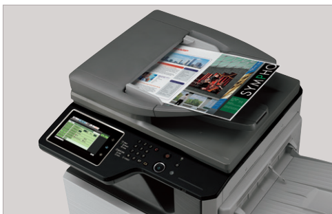
Standard 100-sheet RSPF scans up to 56 images-per-minute.