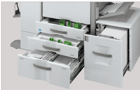
Up to 6,600-sheet paper capacity with available options.