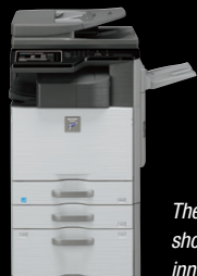
The MX-M564N shown with compact inner finisher.

On-board Document Storage Sharp's easy-to-use document filing system enables users to store frequently used files.