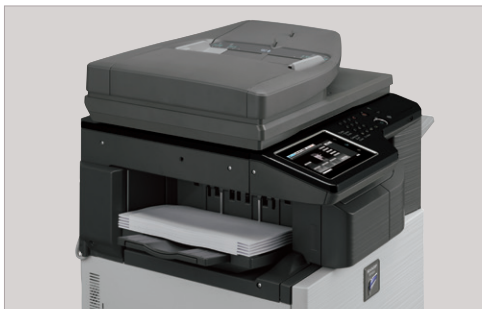
Available compact inner finisher with 50-sheet staple capacity.

A full-featured MFP that is also a strong value – the MX-M364N/M464N/M564N Essentials Series monochrome document systems will exceed your expectations.