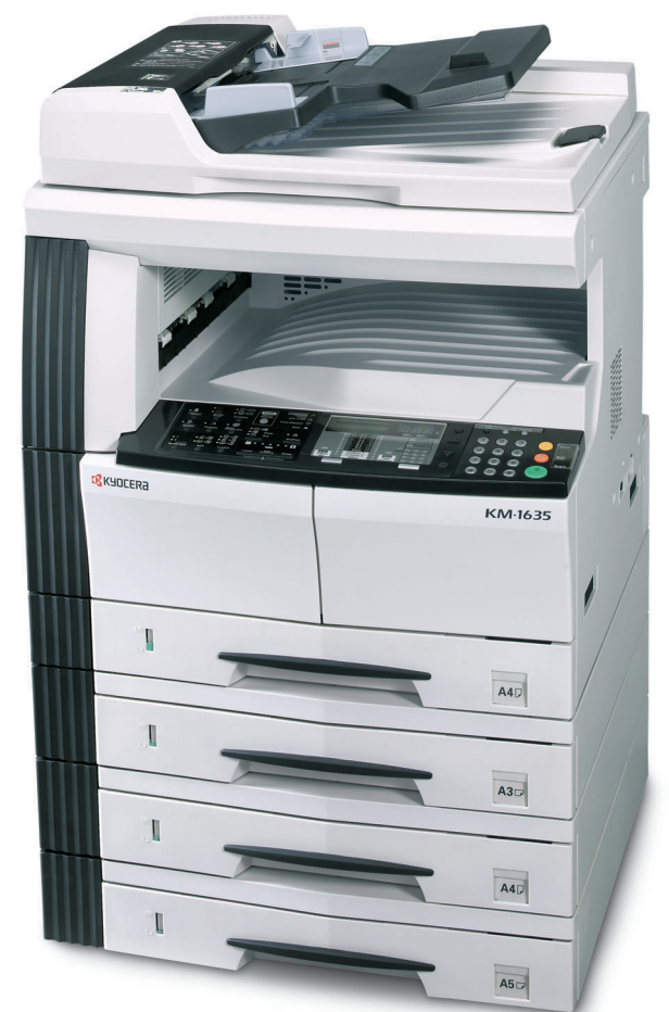
Product depicted includes optional extras

This informative and easy-to-operate display offers quick access to digital features and keeps you fully informed of progress.