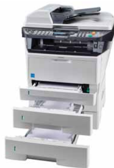
The images displayed in this brochure are for illustrative purposes only, and may include optional extras.

Kyocera does not warrant that any specifications mentioned will be error-free. Specifications are subject to change without notice. Information is correct at time of going to press. All other brand and product names may be registered trademarks or trademarks of their respective holders and are hereby acknowledged.